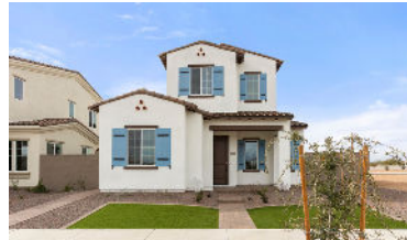
Harmony Plan 492 - Homesite 58 26420 N. 22nd Avenue 2,518 SF | 3 Bed | 3.5 Bath | 3 Car $763,608