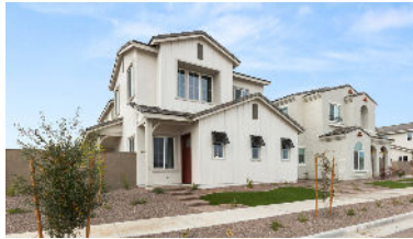
Grace Plan 494 - Homesite 54 26318 N. 22nd Ave. 2,931 SF | 4 Bed | 3.5 Bath | 3 Car $865,362

Limited Time Offer - $50K off Homesites 3,54,57,& 58 PLUS an additional $5K off with preferred lender