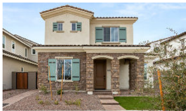
Serene Plan 491 - Homesite 57 26416 N. 22nd Avenue 2,272 SF | 3 Bed | 2.5 Bath | 3 Car $720,419