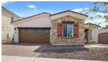
Acclaim Plan One - Lot 137 2113 W. Rowel Road 2,767 SF | 3 Bed | 3.5 Bath | 3 Car $977,143

2014 W. Union Park Dr, Phoenix, AZ 85085 602.777.5175